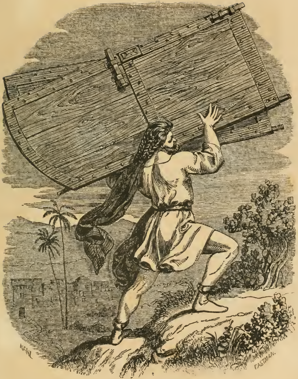
SAMSON CARRYING AWAY THE GATES OF GAZA

“ And Samson lay till midnight, and aros at midnight, and took the doors of the gate of the city upon his shoulders and carried them up to the top of an hill that is before Hebron.” Page 240.